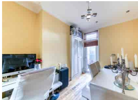
Livingstone Road, Thornton Heath, Surrey, CR7 8JX