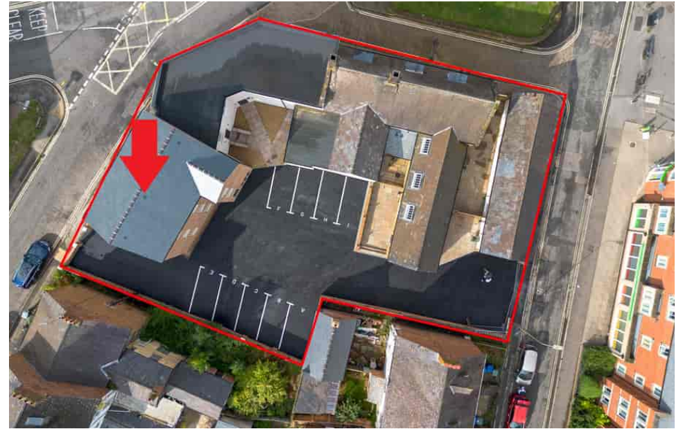
7 The Old Elephant & Castle, Causeway, Banbury, Oxfordshire. OX16 4SN From £234,650 - Share of Freehold