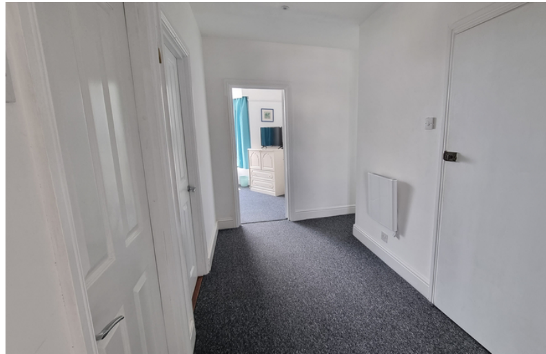
1ST FLOOR FLAT 693 sq.ft. (64.4 sq.m.) approx.