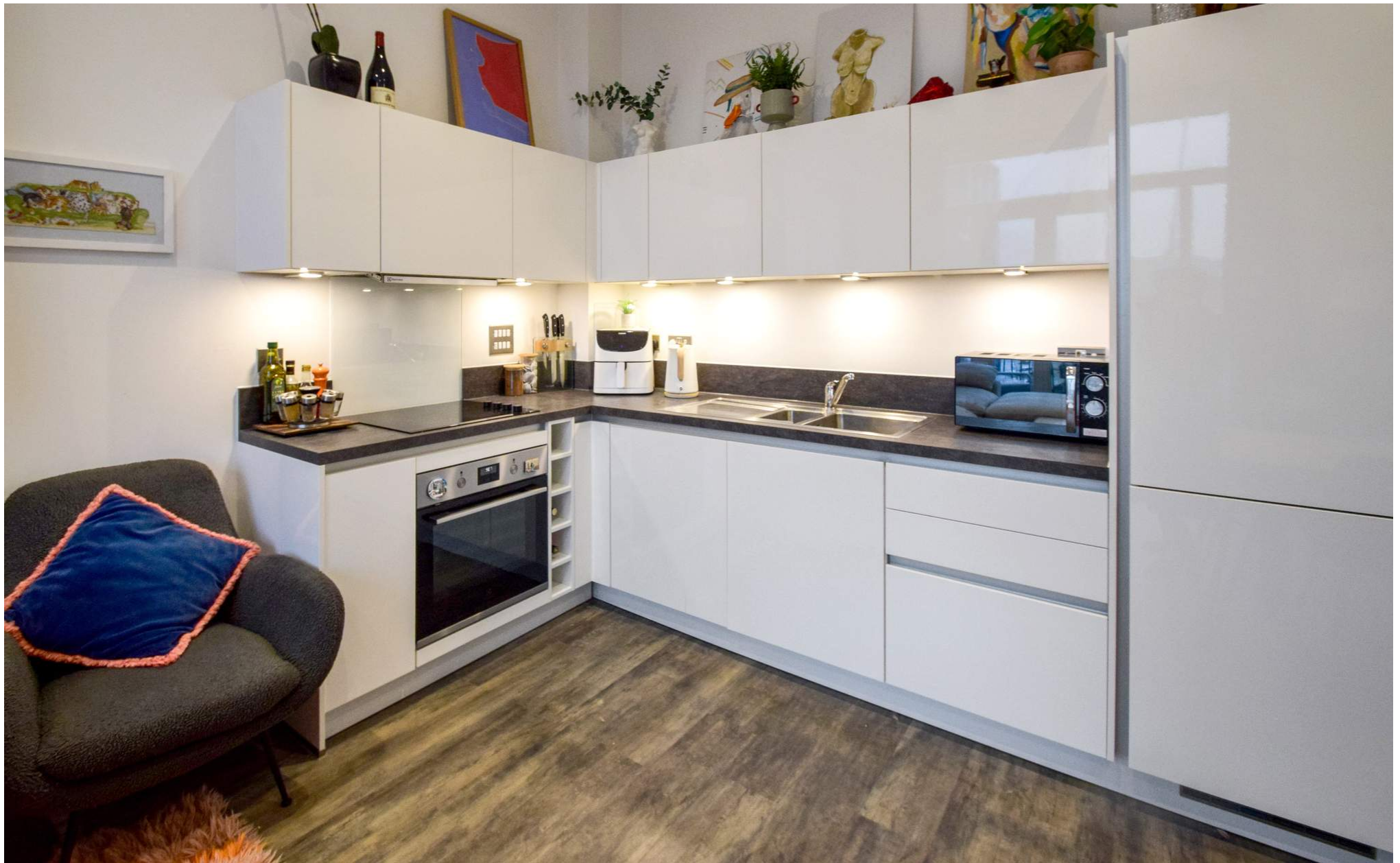
CORYS ROAD, ROCHESTER, KENT, ME1 1GJ