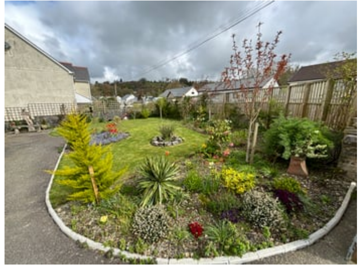
GARDEN (SIXTH IMAGE)