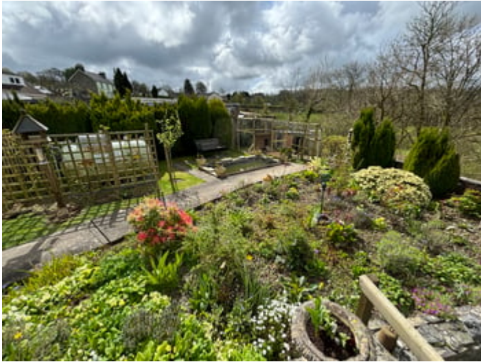
GARDEN (THIRD IMAGE)