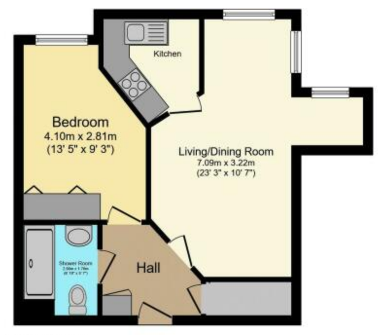
Total floor area 42.2 sq.m. (454 sq.ft.) approx

This floor plan is for illustrative purposes only. It is not drawn to scale. Any measurements, floor areas (including any total floor area), openings and orientation are approximate. No details are guaranteed, they cannot be relied upon for any purpose and they do not form part of any agreement. No liability is taken for any error, omission or misstatement. A party must rely upon its own inspection(s). Powered by www.focalagent.com