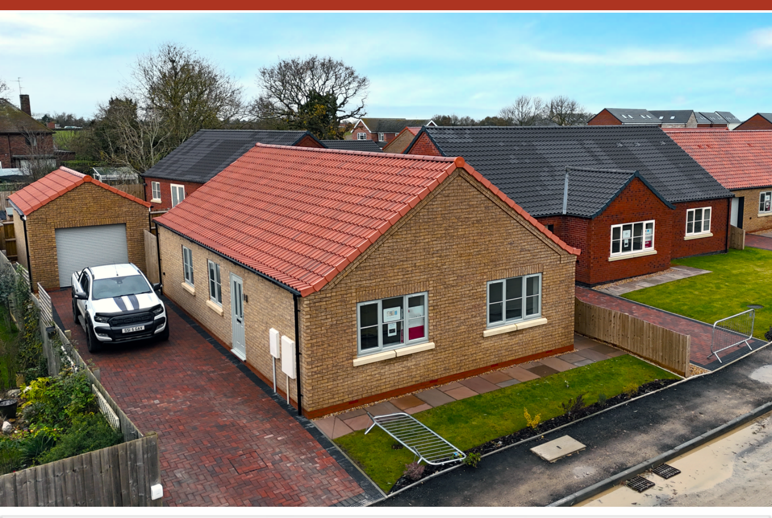
Plot 1 Cedar Close, Quadring, Spalding, Lincolnshire PE11 4GP