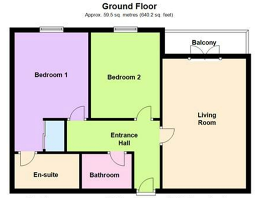
Total area: approx. 59.5 sq. metres (640.2 sq. feet) Floor plans are for layout purposes only Plan produced using PlanUp.

Whilst we have endeavoured to prepare our sales particulars accurately none of the services, appliances or equipment have been tested. A buyer should satisfy themselves on such matters prior to purchase. Any measurements or distances mentioned in these particulars are for guide reference only. If such particulars are fundamental to a purchase, buyers should rely on their own enquiries. All enquiries should be directed to Elevation Estate Agents in the first instance.