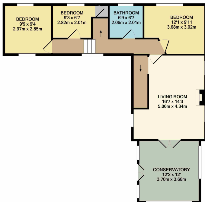
1ST FLOOR APPROX. FLOOR AREA 764 SQ.FT. (71.0 SQ.M.)

Whilst every attempt has been made to ensure the accuracy of the floor plan contained here, measurements of doors, windows, rooms and any other items are approximate and no responsibility is taken for any error, omission, or mis-statement. This plan is for illustrative purposes only and should be used as such by any prospective purchaser. The services, systems and appliances shown have not been tested and no guarantee as to their operability or efficiency can be given Made with Metropix ©2022