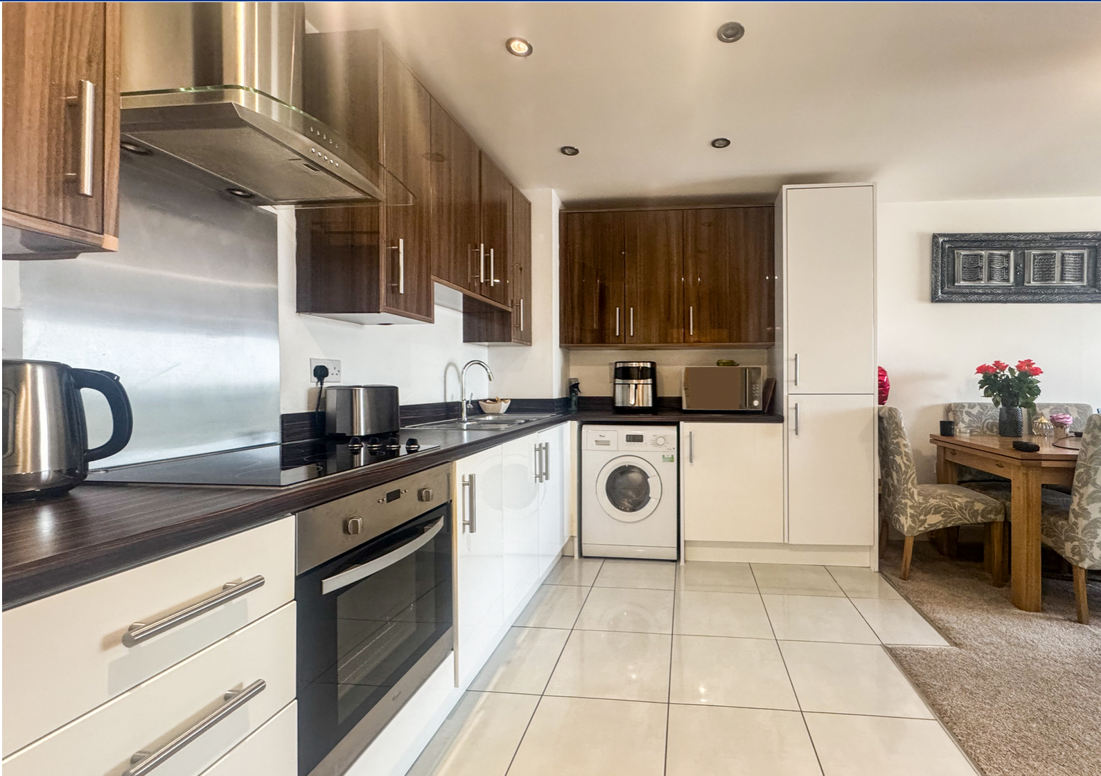
Flat 44 Basing House, Moulsoford Mews, Reading, Berkshire. RG301ES.