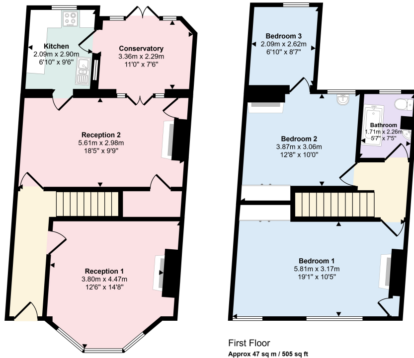
Ground Floor Approx 58 sq m / 629 sq ft

Approx Gross Internal Area 105 sq m / 1134 sq ft