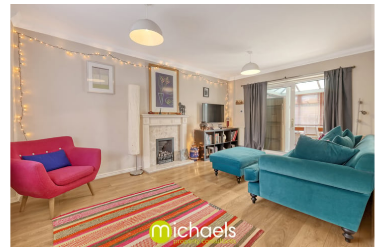
16' 11" x 10' 10" (5.16m x 3.30m)