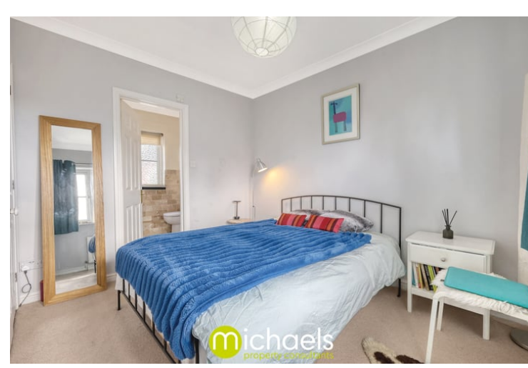
10' 4" x 10' 11" (3.15m x 3.33m)