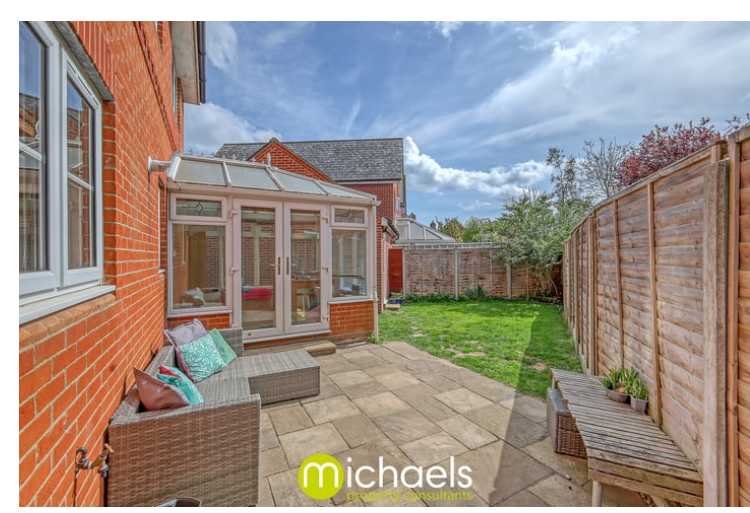
Outside, this wonderful home enjoys an easy to manage garden, commencing with a patio area that offers itself as the ideal place for al-fresco dining and outdoor seating furniture. The remainder of the garden is predominately laid to lawn, and boundaries are formed by panel fencing. The property is further enhanced by off road parking and a garage.