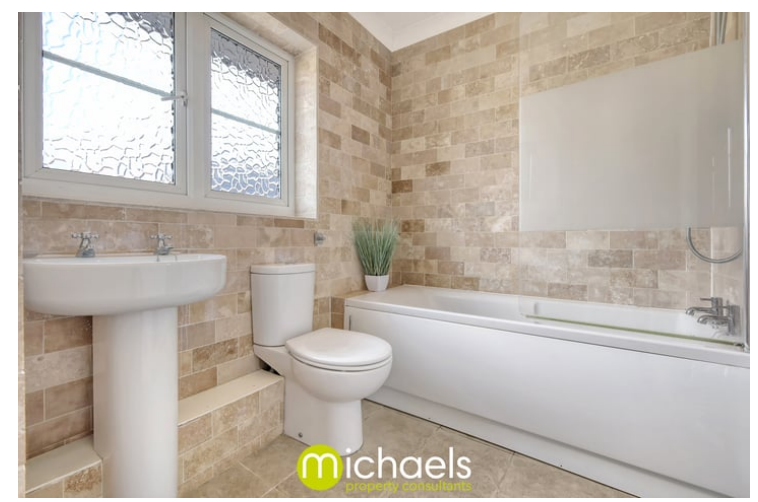
6' 3" x 7' 11" (1.91m x 2.41m)