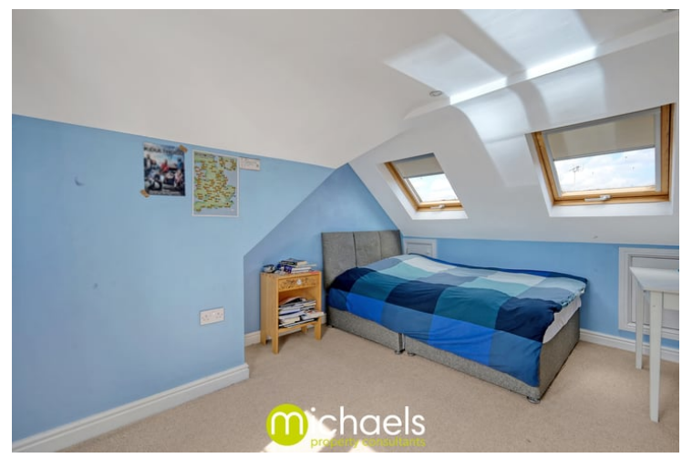
12' 10" x 10' 2" (3.91m x 3.10m)