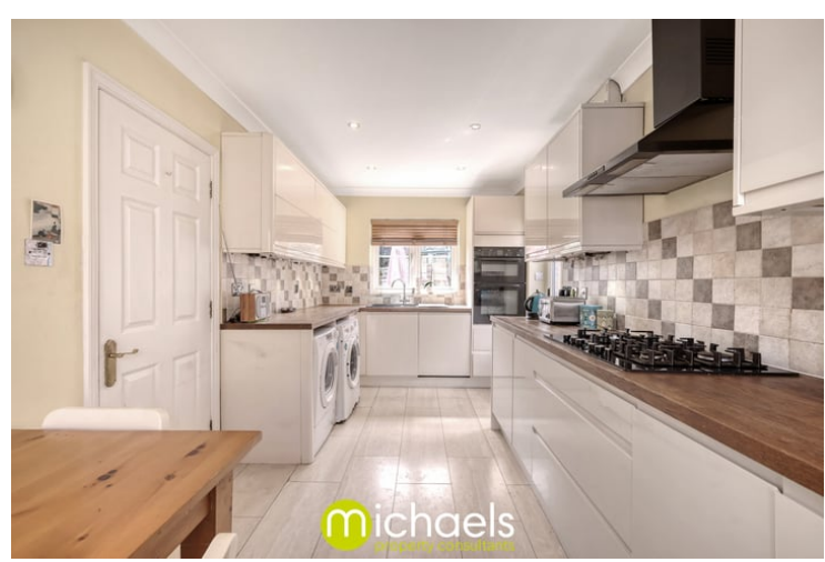
16' 11" x 8' 6" (5.16m x 2.59m)