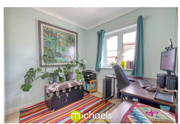
9' 5" x 8' 2" (2.87m x 2.49m)