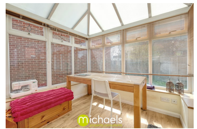
9' 8" x 9' 5" (2.95m x 2.87m)