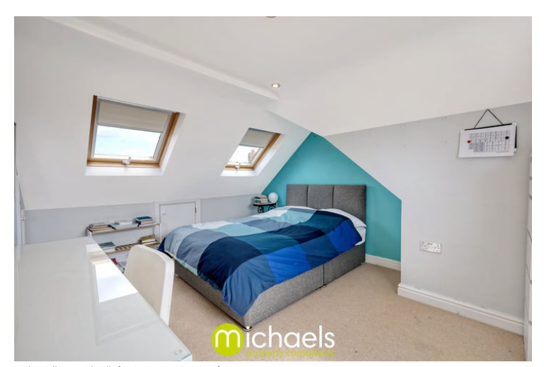
12' 10" x 10' 9" (3.91m x 3.28m)