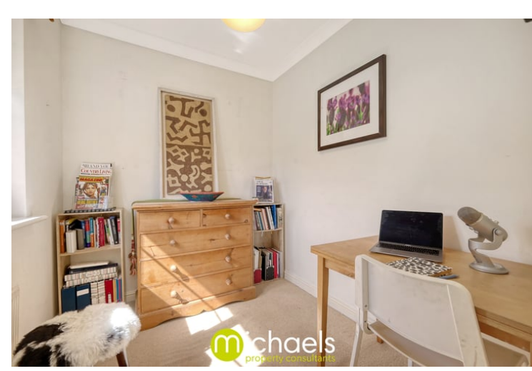
7' 3" x 8' 2" (2.21m x 2.49m)