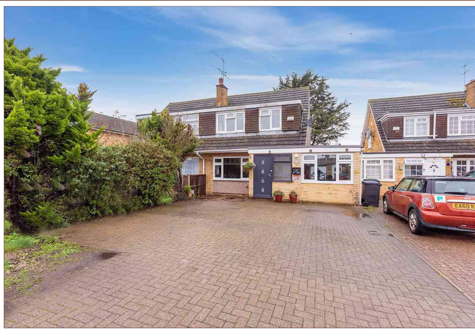
This extended four bedroom semi-detached family home is situated within a popular residential area just a short walk from Taplow Train Station (Queen Elizabeth Line) and within close proximity of Lent Rise Combined School which is a feeder school into Burnham Grammar. The property is offered to the market as superbly presented and offers flexible and spacious living accommodation.

The ground floor features three reception rooms with the inclusion of a 17ft living room, a 20ft study/family room and an 11ft dining room. There is also a stunning refitted 16ft kitchen/breakfast room with a centre island, fitted appliances and space for a range cooker. The property includes a home office and annexe (bedroom with ensuite) which could offer separate living from the main house if required.