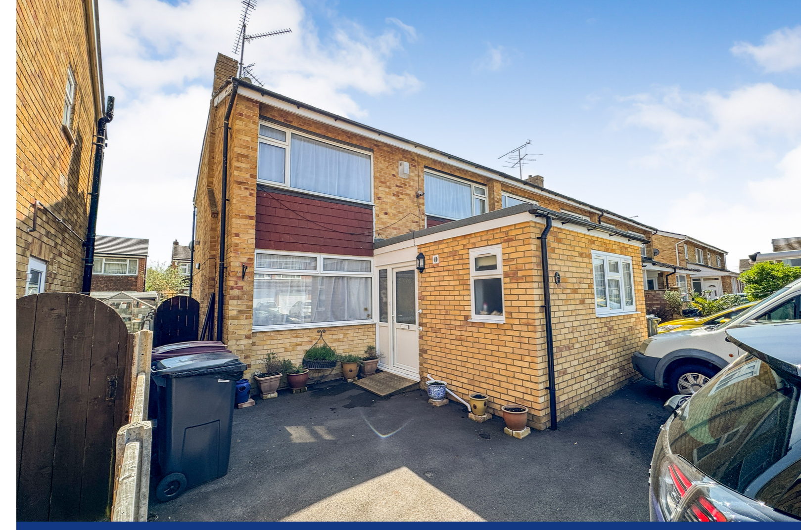
Warnford Road, Tilehurst, Reading.