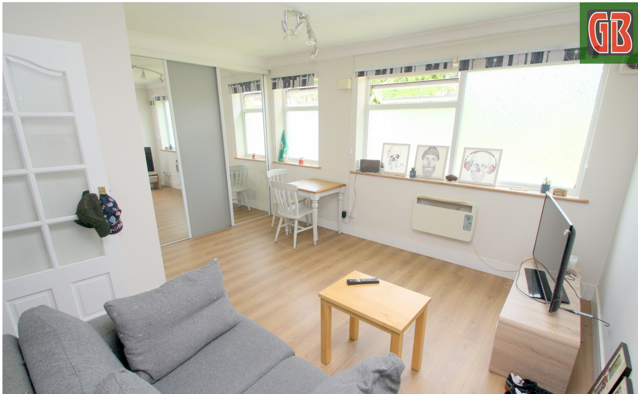
3 Norman Court Kingston Road, Staines-upon-Thames. TW18 4NU. 0 Bedroom Apartment - £180,000 Share of Freehold