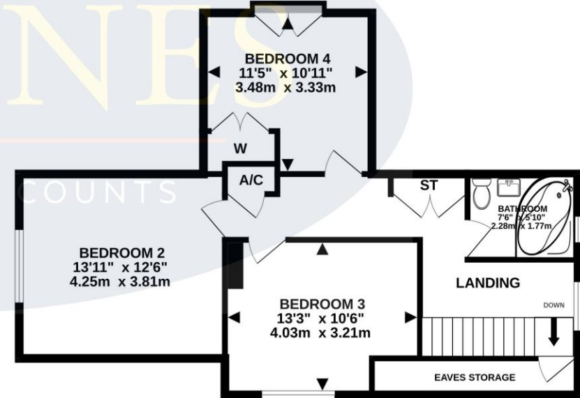
1ST FLOOR 654 sq.ft. (60.8 sq.m.) approx.

AGENTS NOTES: The heating system, mains and appliances have not been tested by Hearnes Estate Agents. Any areas, measurements or distances are approximate. The text, photographs and plans are for guidance only and are not necessarily comprehensive. Whilst reasonable endeavours have been made to ensure that the information in our sales particulars are as accurate as possible, this information has been provided for us by the seller and is not guaranteed. Any intending buyer should not rely on the information we have supplied and should satisfy themselves by inspection, searches, enquiries and survey as to the correctness of each statement before making a financial or legal commitment. We have not checked the legal documentation to verify the legal status, including the leased term and ground rent and escalation of ground rent of the property (where applicable). A buyer must not rely upon the information provided until it has been verified by their own solicitors.