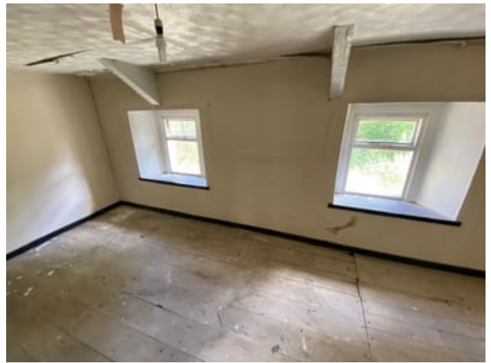
Front Bedroom 3

Which has a low level flush toilet, wash hand basin and ample space for bath/shower.