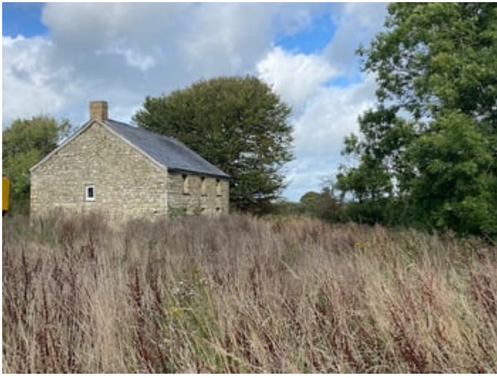
Traditional stone range