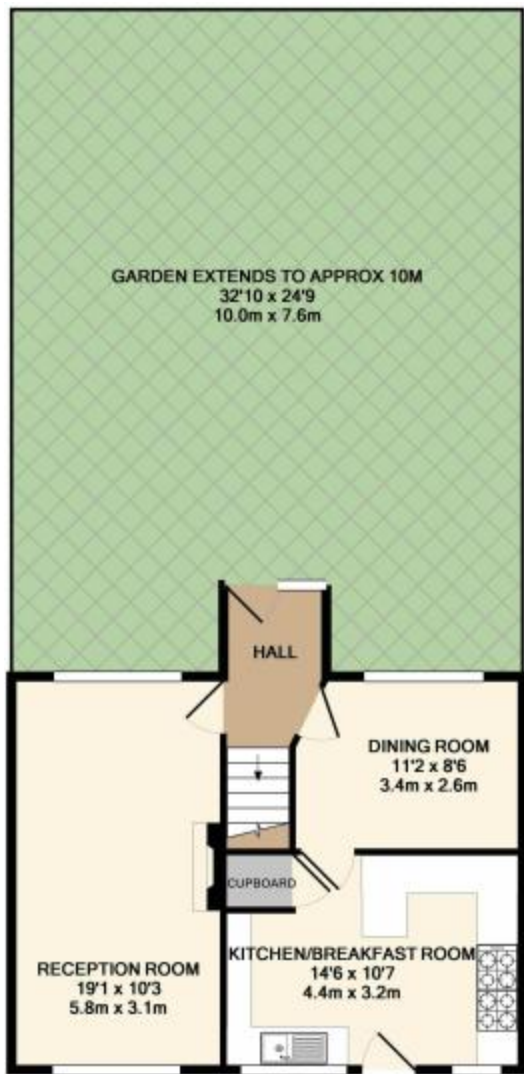
GROUND FLOOR APPROX. FLOOR AREA 494 SQ.FT. (45.9 SQ.M.)

This delightful Three / Four bedroom home situated in the popular leafy village of Northaw with exceptional panoramic views over countryside to the rear of the home. The family home consists dual aspect lounge, kitchen breakfast room and fourth bedroom on the ground floor. The first floor benefits from two double bedrooms with spectacular open countryside views, one single bedroom, plus a family bathroom with separate WC.