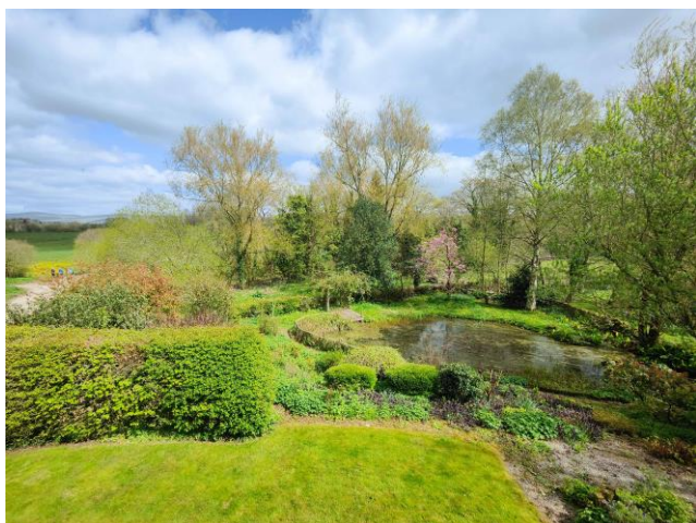
VIEW FROM THE LOUNGE

GARAGE (18'3 x 11'3) Electric up and over door, light, power and double glazed window to the side.