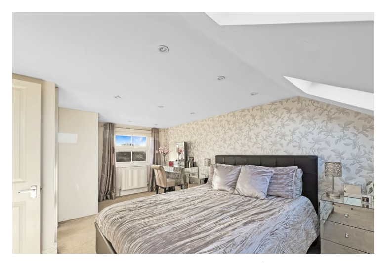
17' 6" x 11' 0" (5.33m x 3.35m)