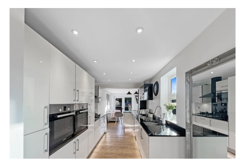
27' 0" x 8' 1" (8.23m x 2.46m)