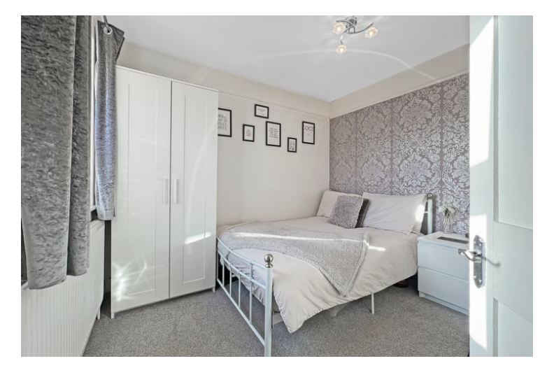
9' 7" x 9' 0" (2.92m x 2.74m)