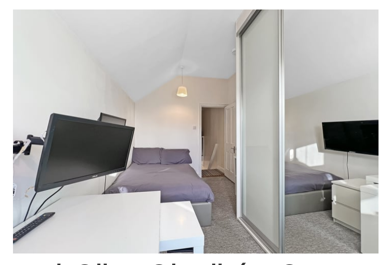
14' 3" x 8' 1" (4.34m x 2.46m)