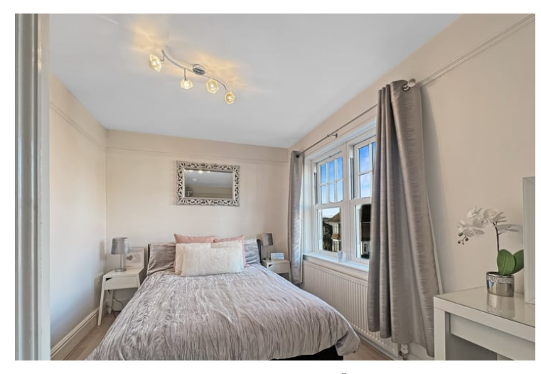
14' 5" x 8' 5" (4.39m x 2.57m)