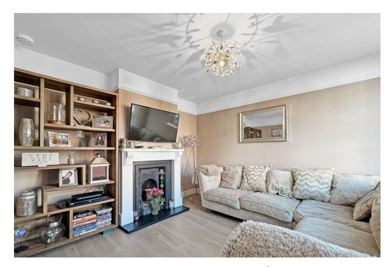
13' 9" x 11' 1" (4.19m x 3.38m)