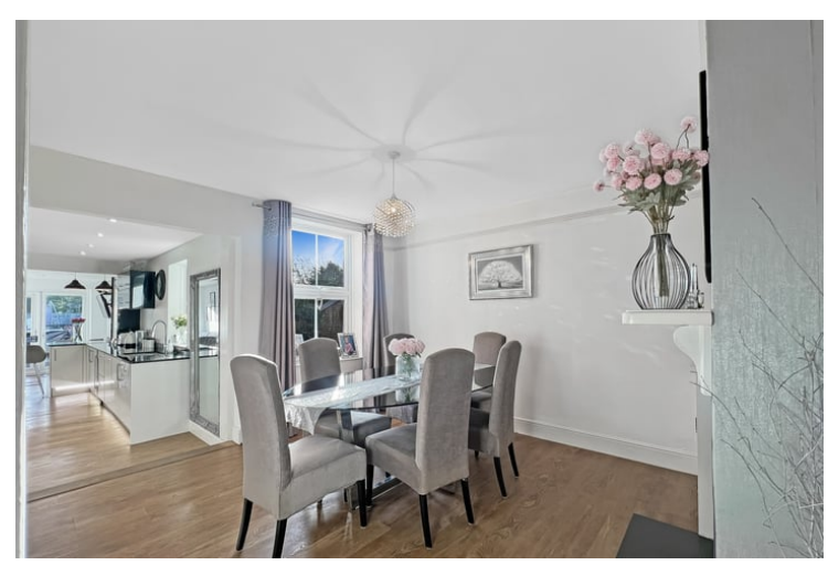
12' 5" x 11' 7"