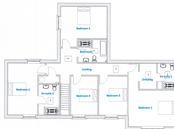
Approx floor area = 1283 Sq ft