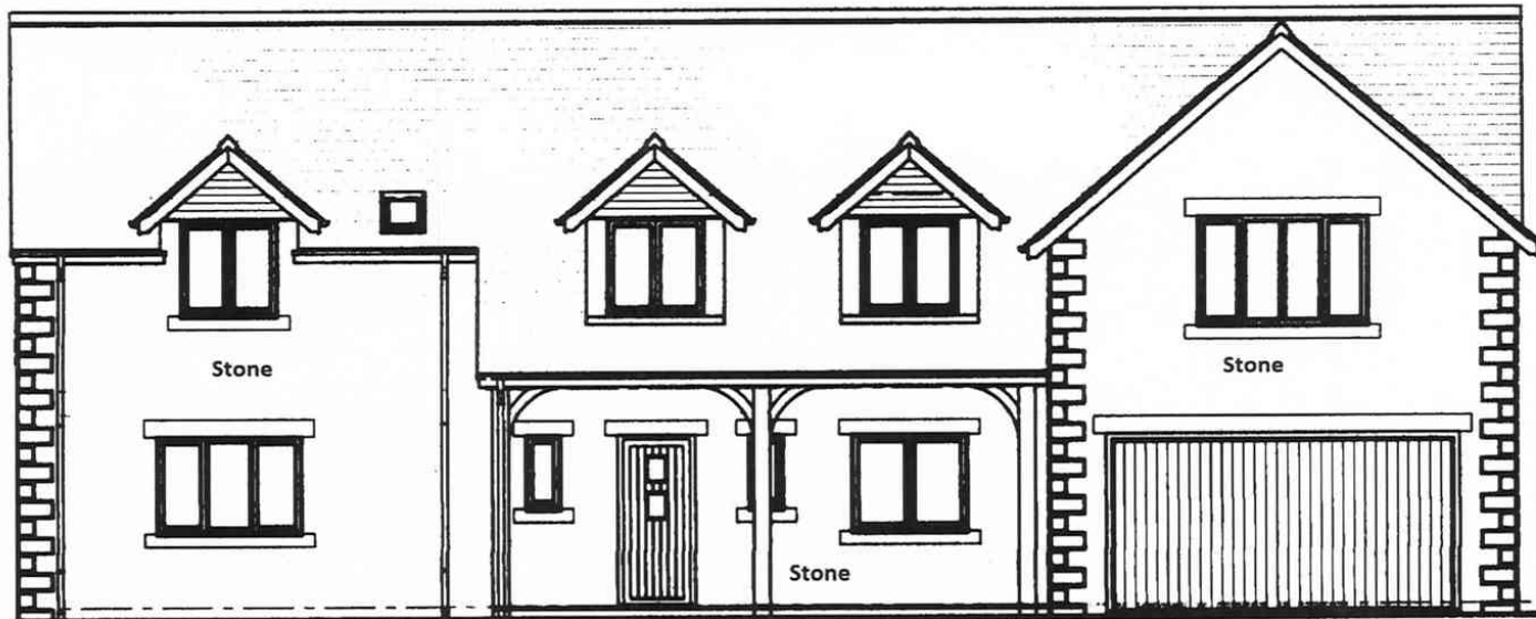
North & South Elevations Plot 1 Priors Garth