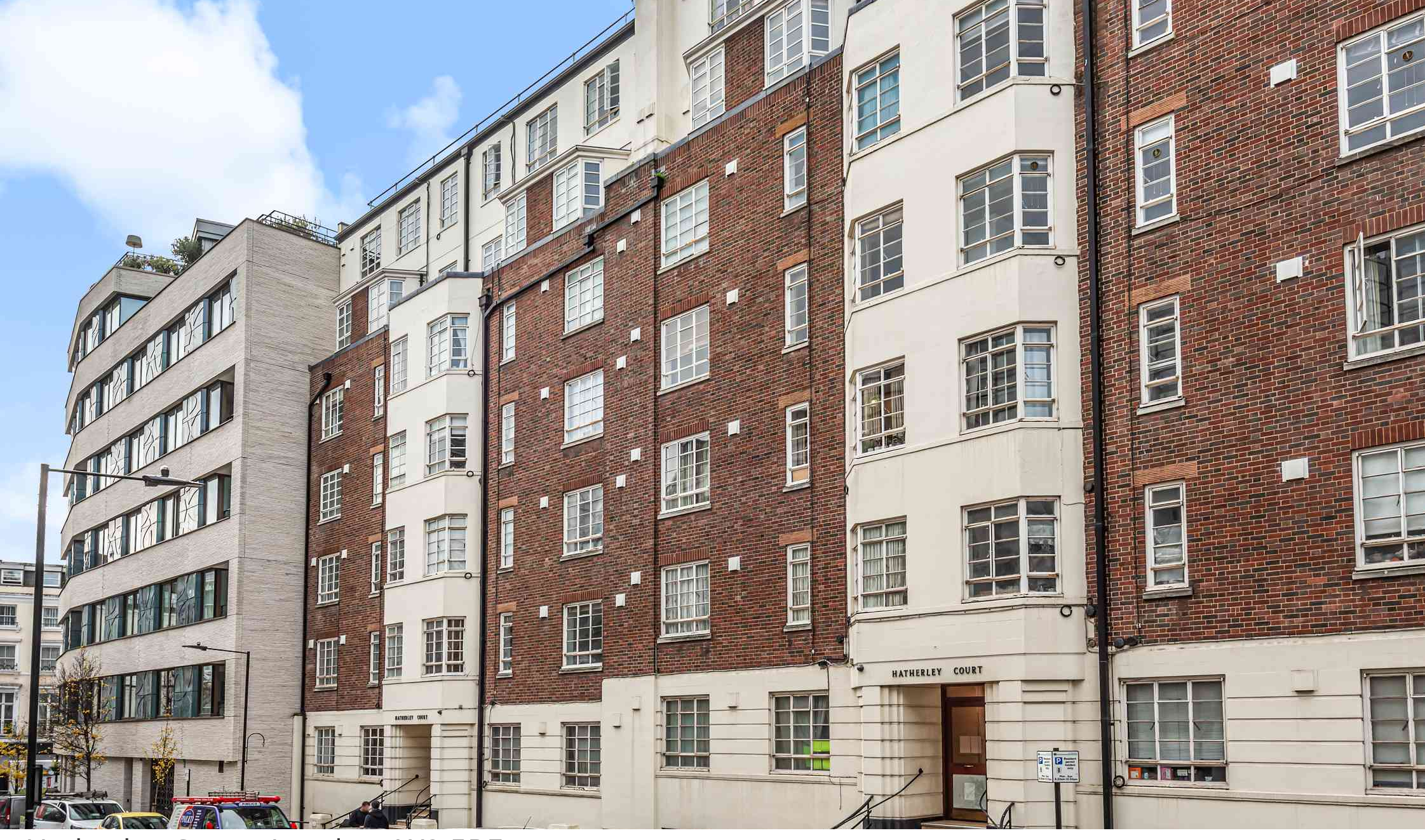
Hatherley Grove, London, W2 5RE