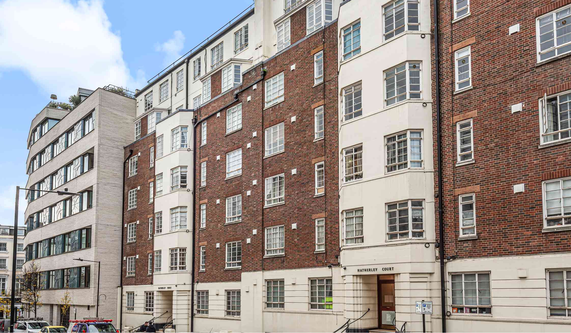
Hatherley Grove, London, W2 5RE