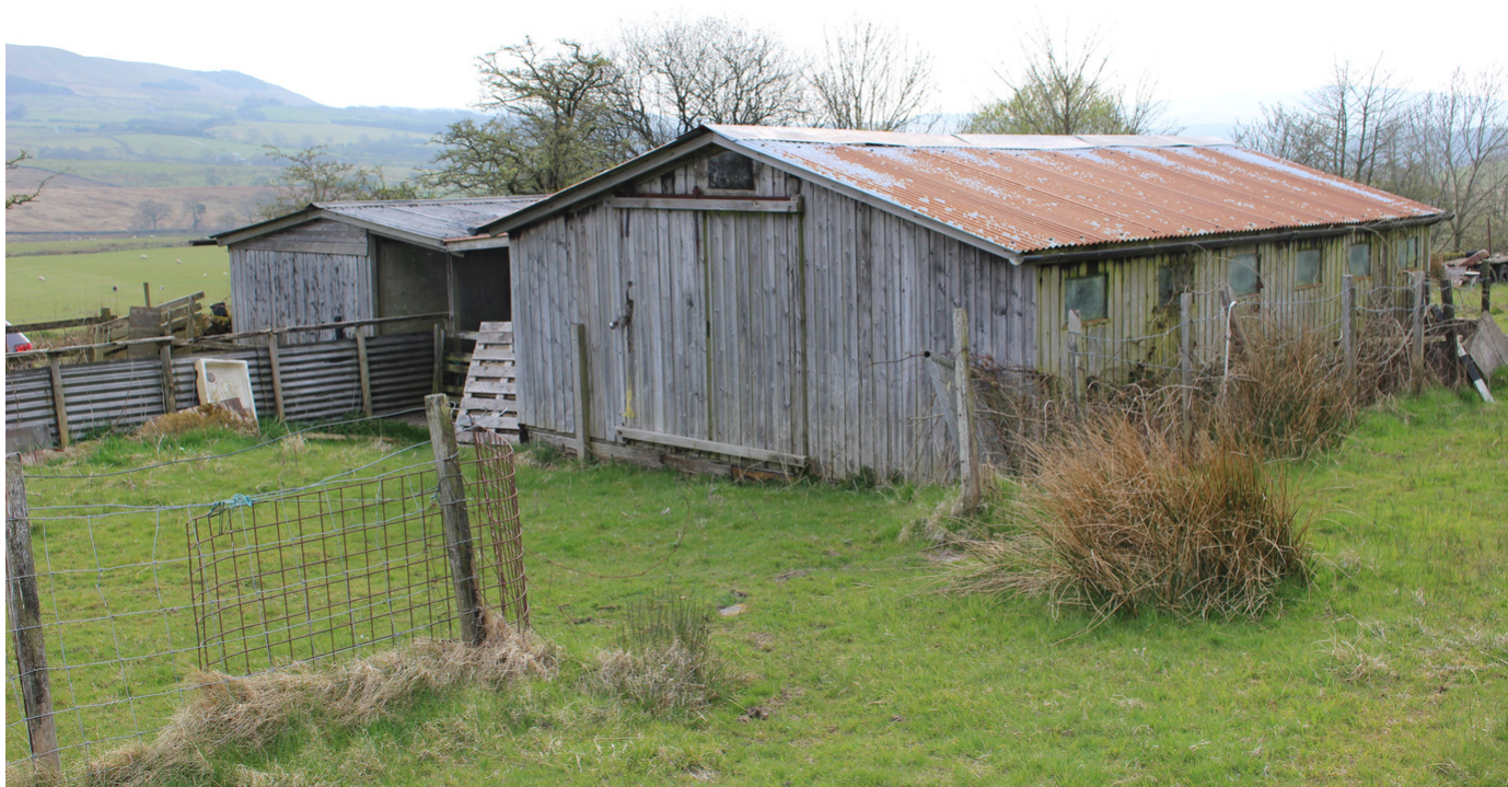
Slaidburn - 1 Mile