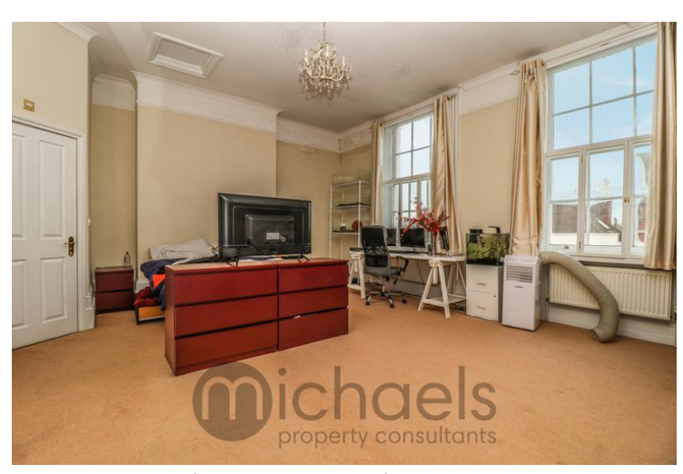
19' 10" \times 17' 8" ( 6.05m \times 5.38m ) Secondary glazed sash window to front aspect, \times 2 storage cupboards, radiator, further door to: