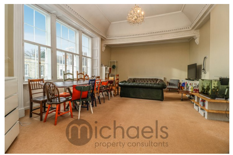
25' 11" max x 17' ( 7.90m max x 5.18m ) High ceilings, large feature secondary glazed sash windows to front, ornate cornicing, telephone/television point, radiator