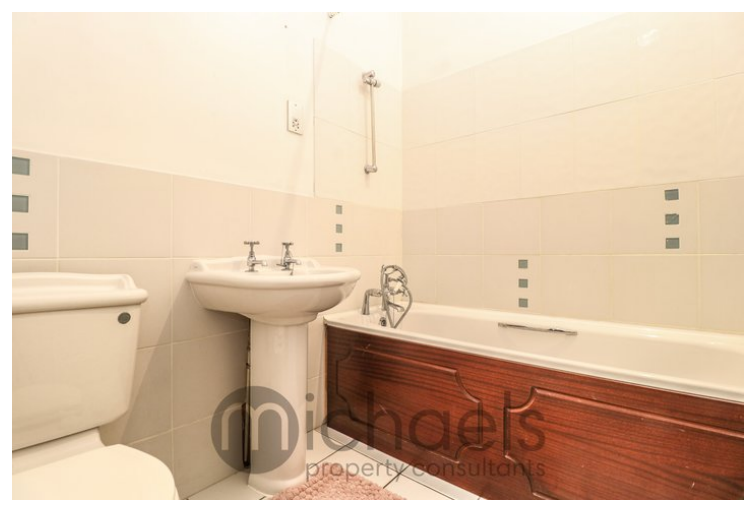
Panel enclosed bath with shower attachment over, pedestal wash hand basin, low level W.C, heated towel rail