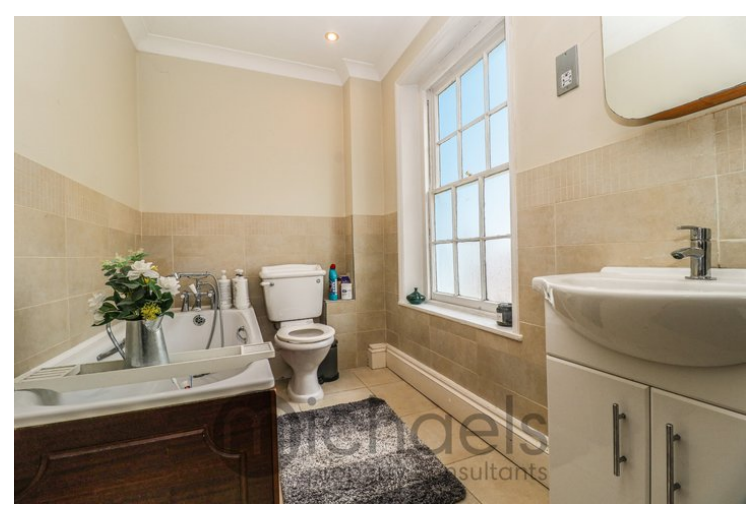
Panel enclosed bath with shower attachment over, low level W.C, wash hand basin, shower cubicle