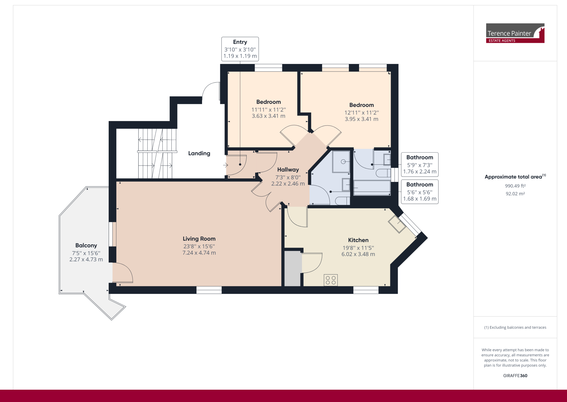
Flat 39, 61 Charleston Court, West Cliff Road, Broadstairs, Kent. CT10 1RY.