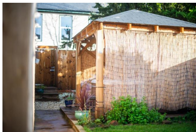
GAZEBO & HOT TUB

TENURE We are informed the tenure is Freehold.