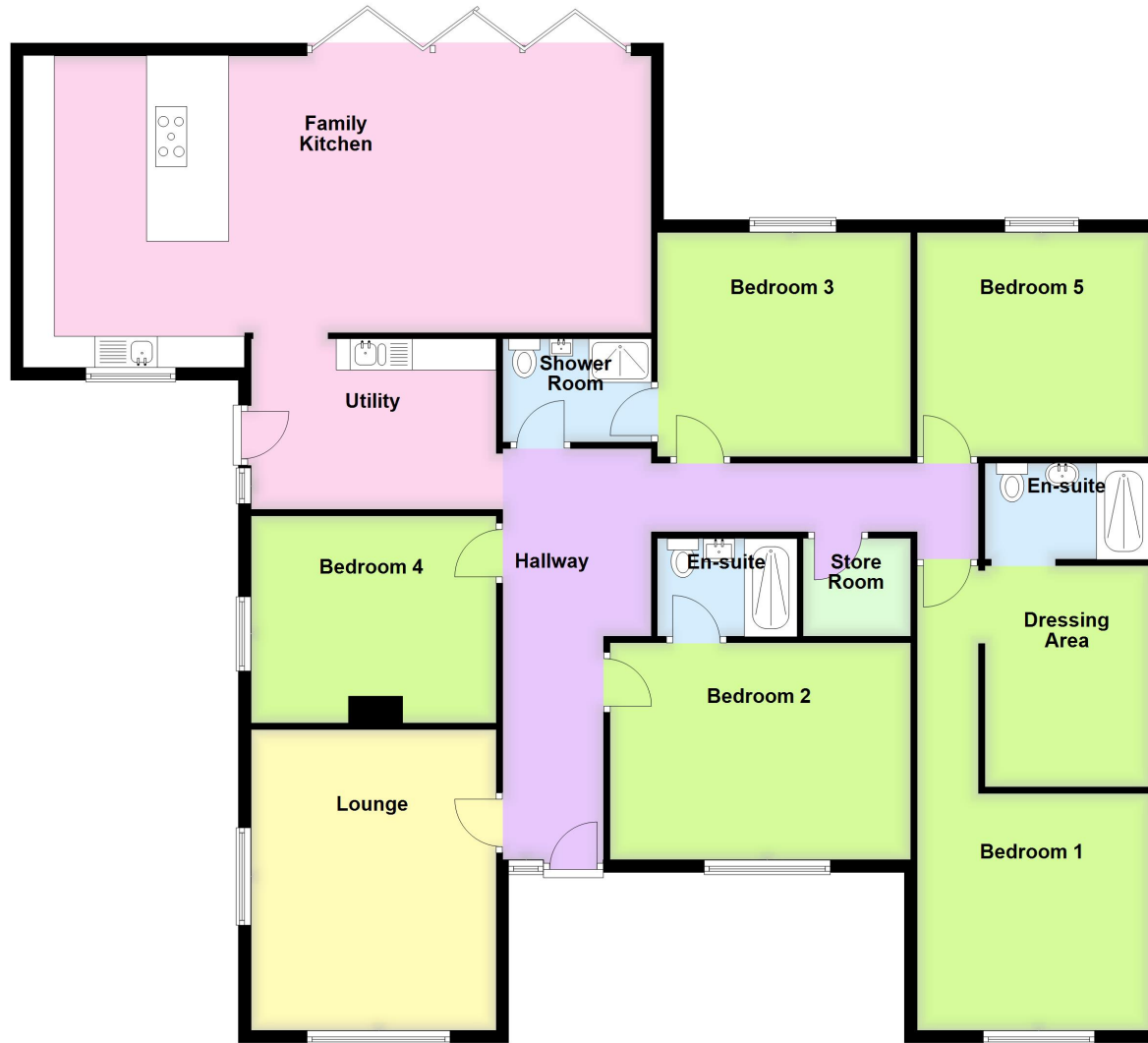
Total area: approx. 202.8 sq. metres (2183.0 sq. feet)