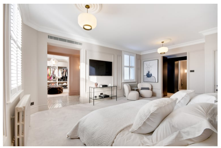
4.29m x 5.75m (14' 1" x 18' 10")