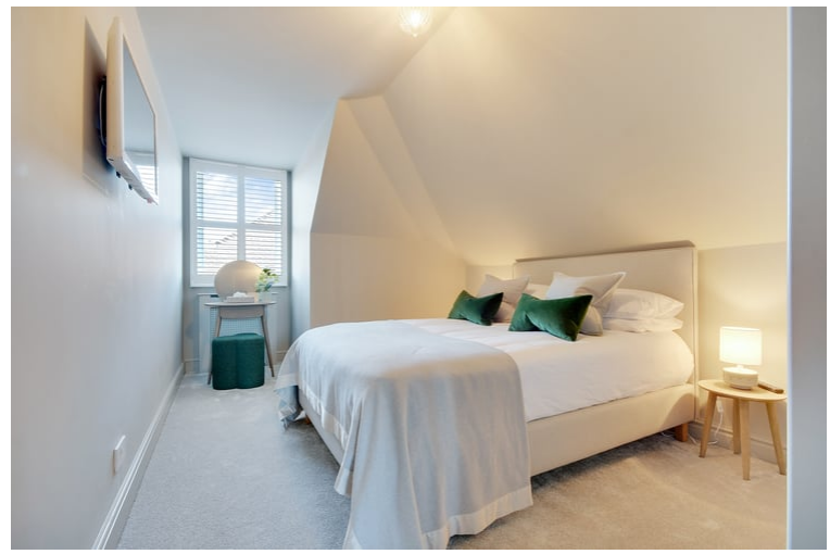
2.36m x 3.91m (7' 9" x 12' 10")

Bedroom Six/Study 2.47m x 4.86m (8' 1" x 15' 11")