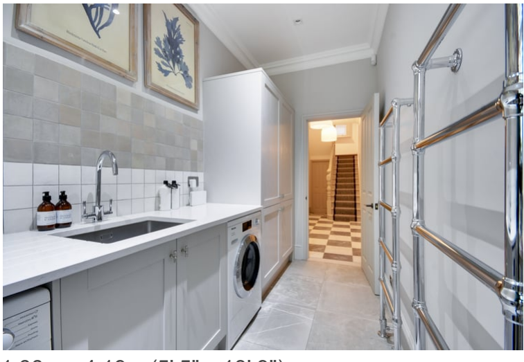
1.66m x 4.19m (5' 5" x 13' 9")