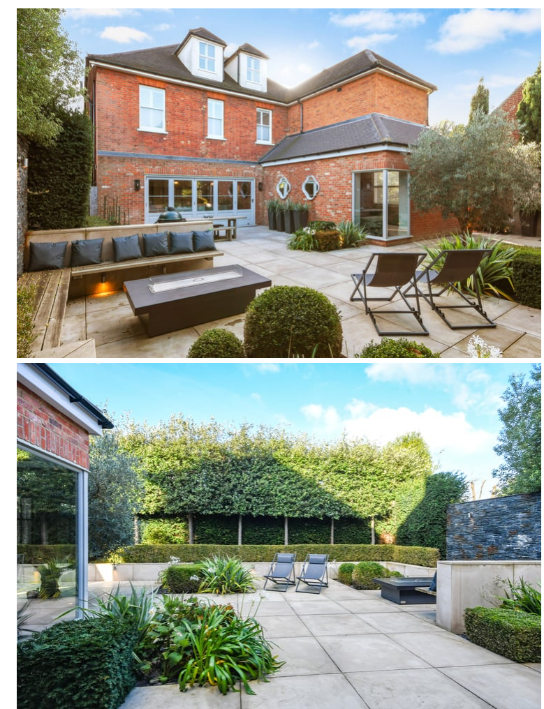
Walled Side Garden