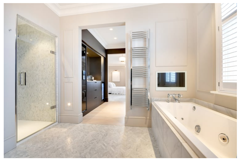
3.23m x 3.07m (10' 7" x 10' 1")