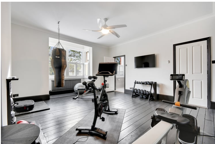
4.62m x 4.58m (15' 2" x 15' 0")