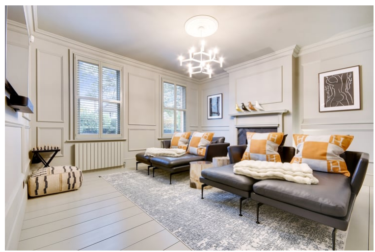
4.62m x 4m (15' 2" x 13' 1")