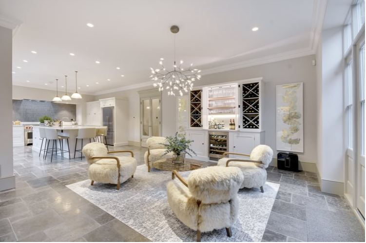
6.42m x 4.59m (21' 1" x 15' 1")