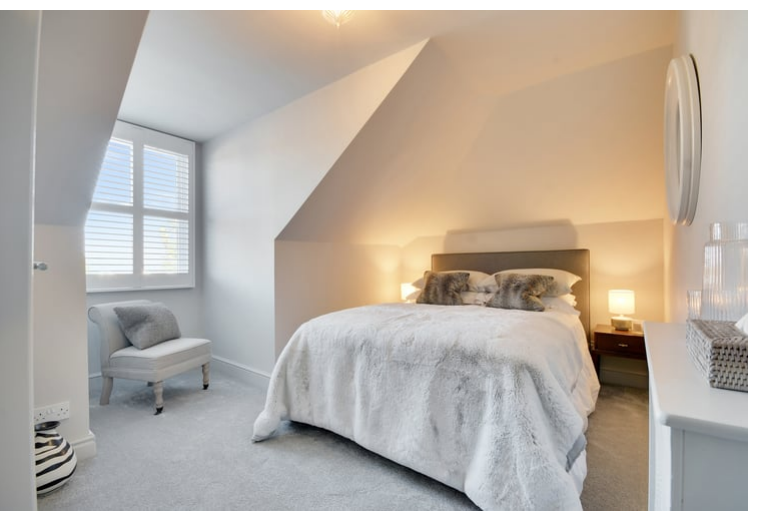
2.85m x 4.59m (9' 4" x 15' 1")