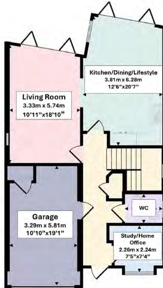
Ground Floor Approx 87 sq m / 932 sq ft

Approx Gross Internal Area 162 sq m / 1742 sq ft