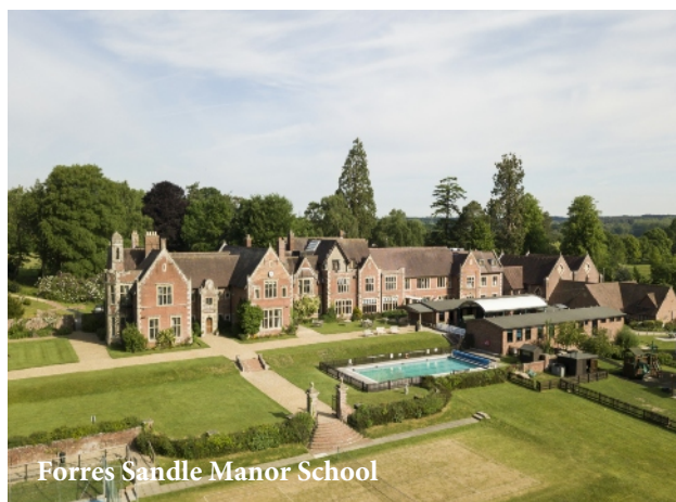
Forres Sandle Manor School