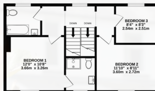
1ST FLOOR 524 sq.ft. (48.7 sq.m.) approx.