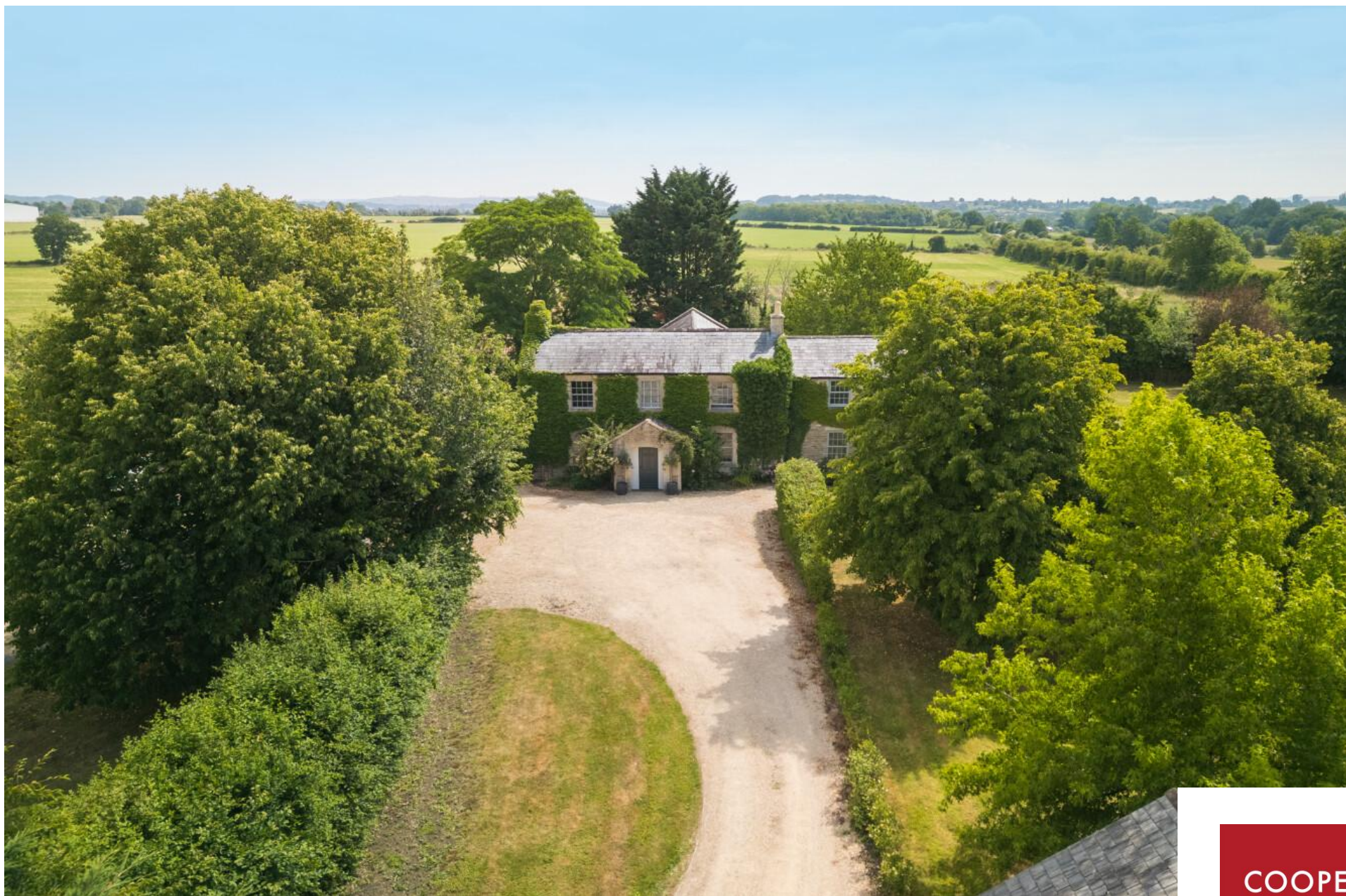
Newtown Farm House, Semington, Trowbridge, Wiltshire, BA14 6JU