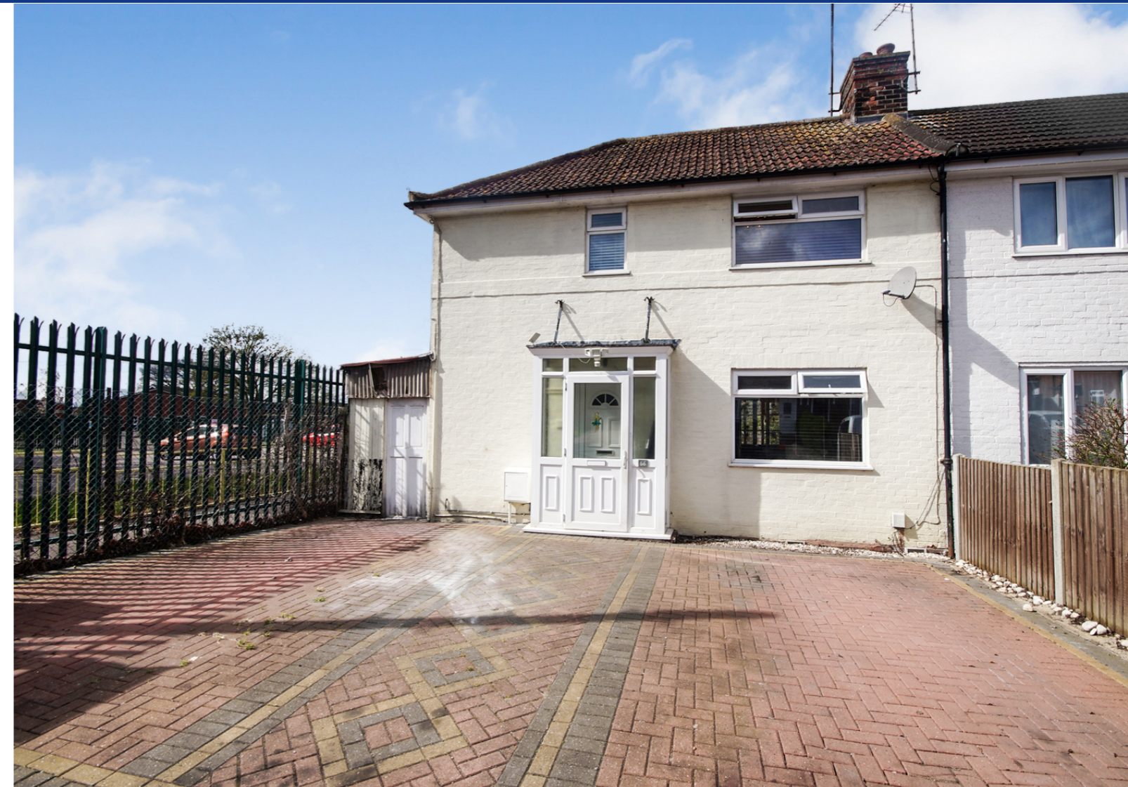
66 Brixham Road, Reading, Berkshire. RG2 7RB.