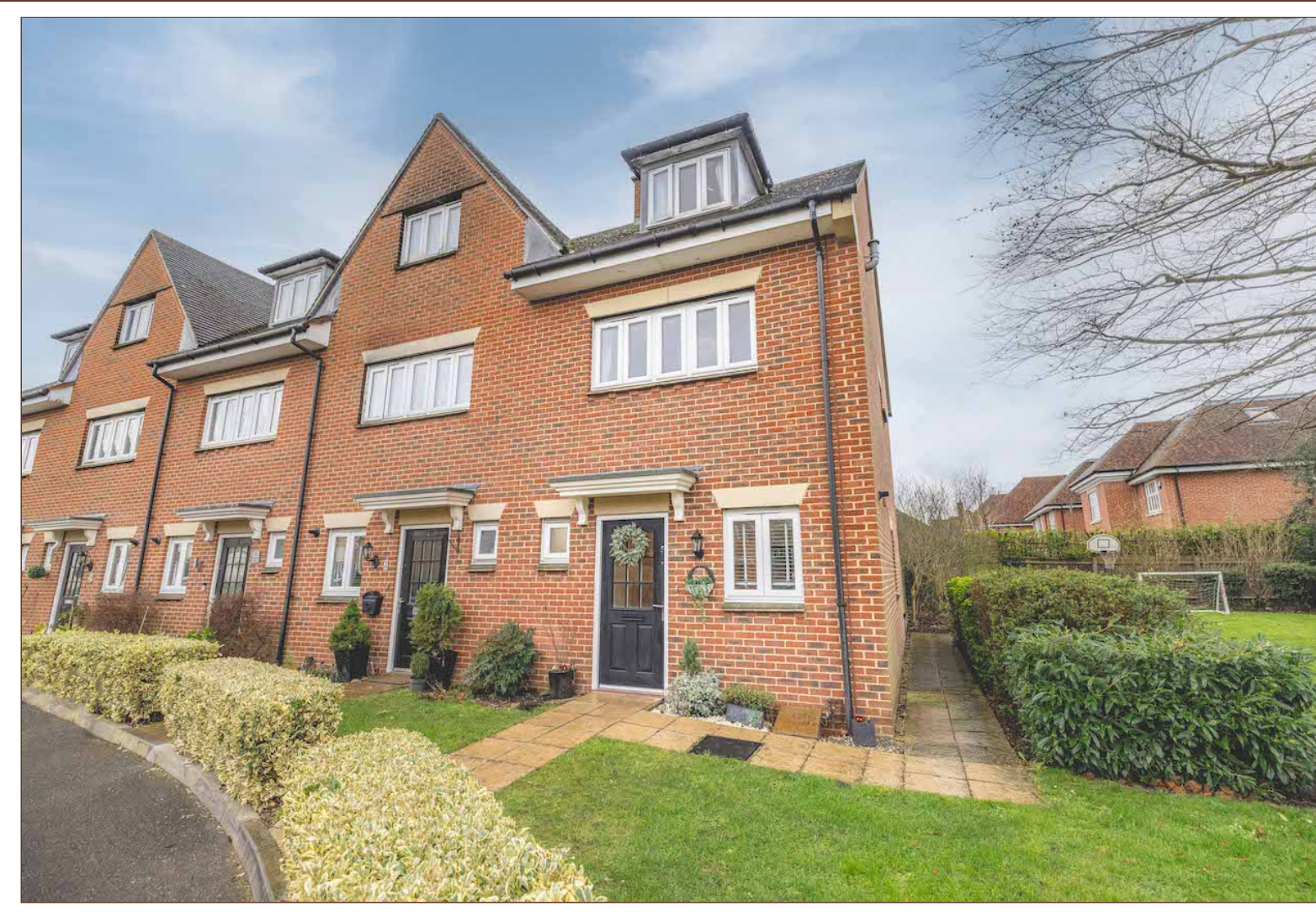
Situated in the heart of this modern impressive development, is this stunning end of terrace family home. Properties such as these are rarely available within the local area and Montague Close is the perfect example of a highly desired residential area that is made to house your long term family home.

Montague Close provides a mixture or semi-rural living while still having fantastic links into all major towns and Cities. The immediate area is ideal for young families as it benefits from fantastic local school catchments and is also located within easy access of Stunning nature reserves such as Burnham Beeches and Cliveden, which are perfect for the entire family to enjoy at the weekends. Burnham railway station (Elizabeth Line) and M4 & M40 junctions are both a short distance away.