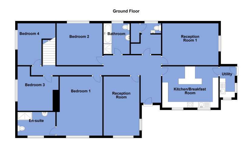
Total area: approx. 225.2 sq. metres (2424.1 sq. feet) THIS FLOOR PLAN IS FOR ILLUSTRATION ONLY AND IS NOT A SCALE DRAWING, SOFT IS AN APPROXIMATE GUIDE