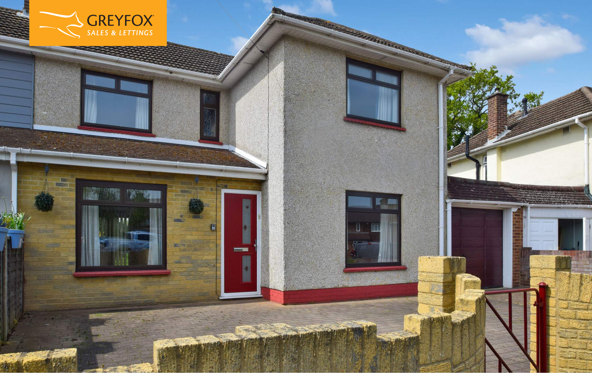
Three Bedroom Semi-Detached House Burma Way, Chatham, Kent, ME5 0JL