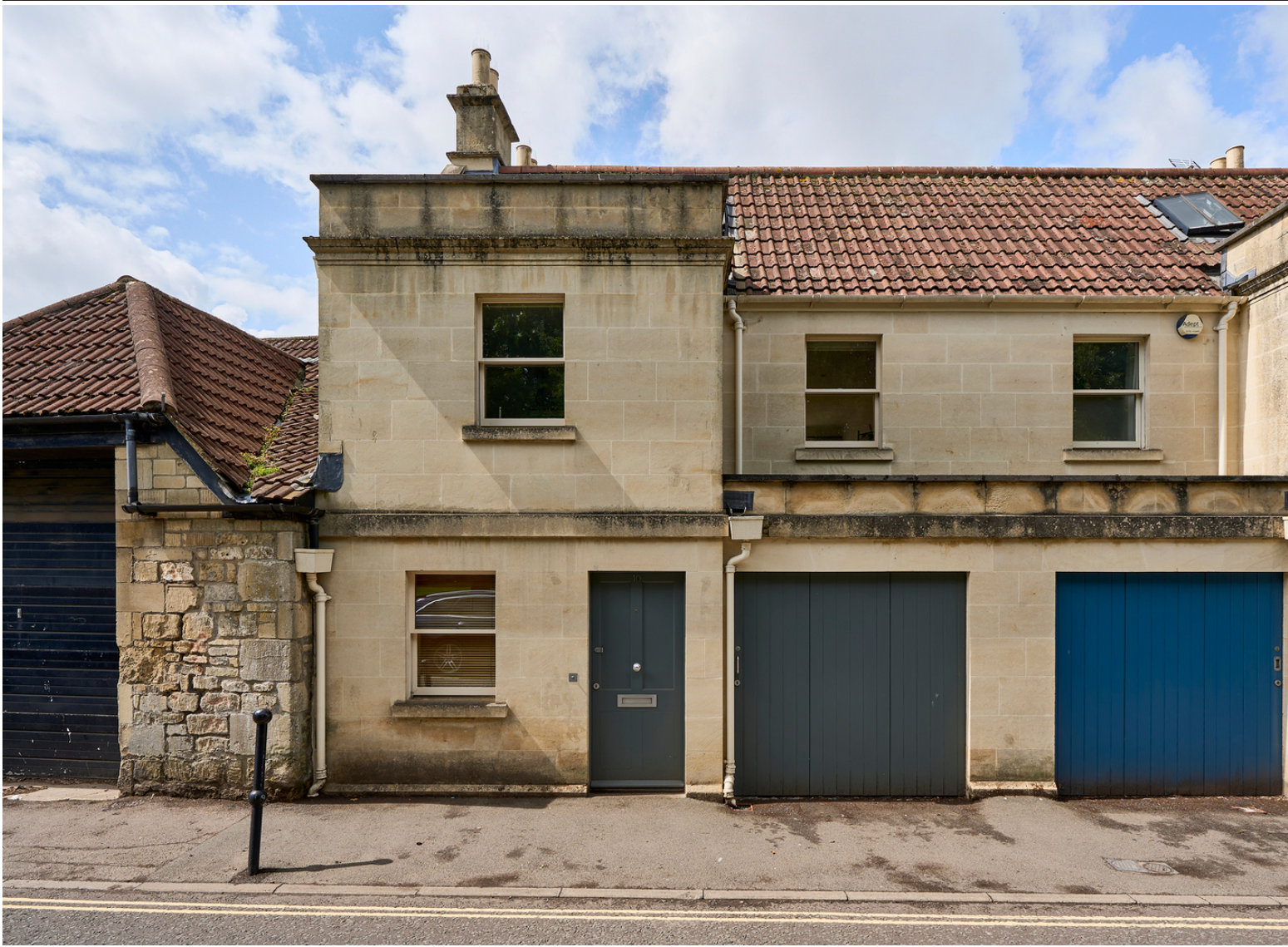
Crescent Lane, Bath