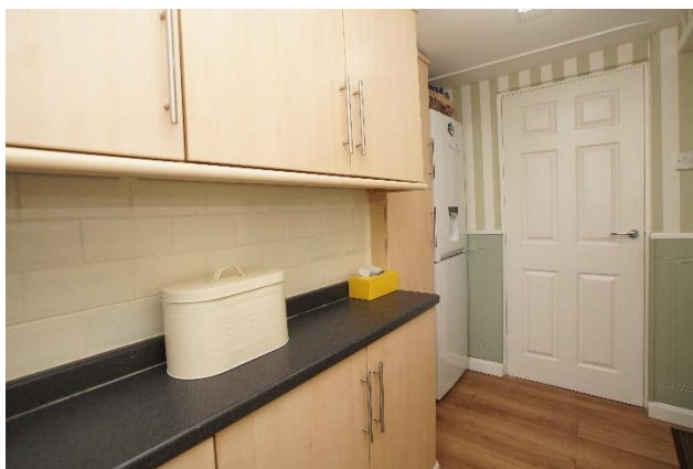
EXTENDED KITCHEN AREA

UTILITY ROOM (8' x 6'3) Tile effect vinyl flooring, radiator, plumbing for washing machine and UPVC double glazed door leading out to the front garden.