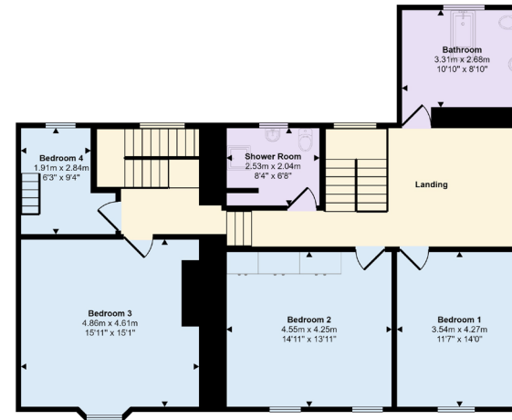
First Floor Approx 117 sq m / 1288 sq ft