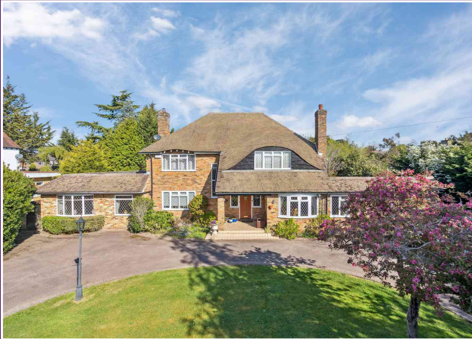
Cadena House Norwood Lane, Iver, Buckinghamshire. SL0 0EW.

HILTON KING & LOCKE SPECIALISTS IN PROPERTY