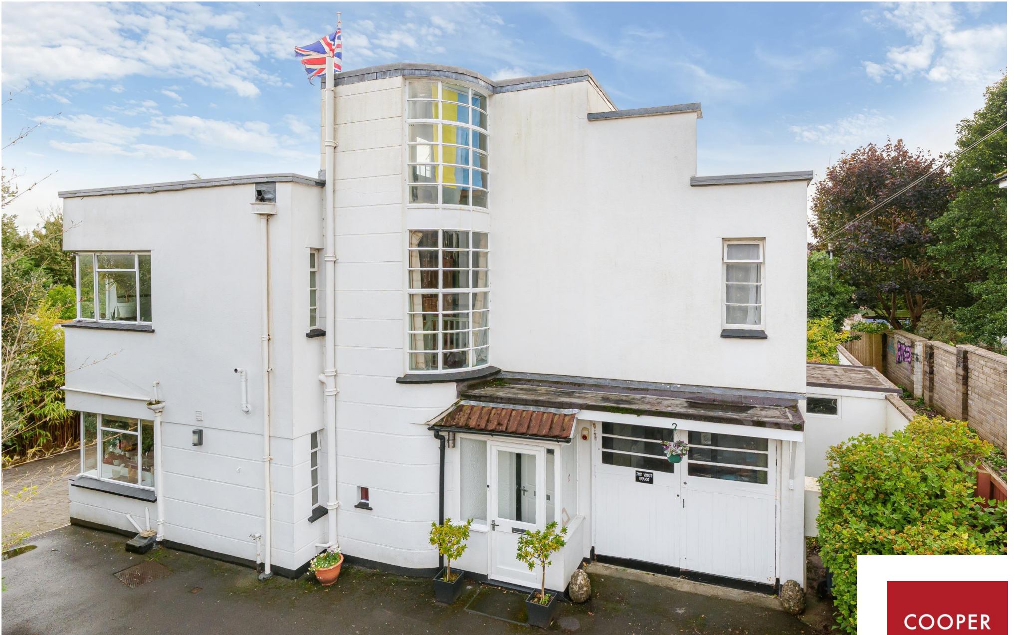
The White House, 71 Portway, Wells, BA5 2BJ