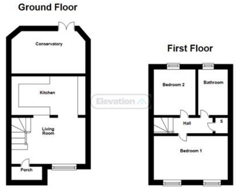
Floor plans are for layout purposes only. Measurements are approximate and subject to inaccuracies