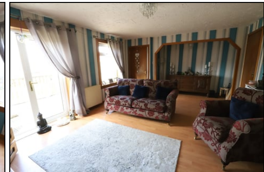
5.9m x 4.1m (19' 4" x 13' 5")