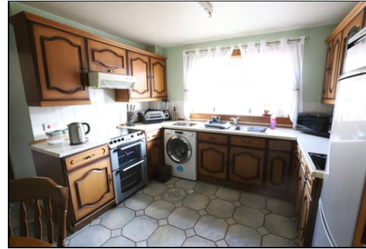
3.8m x 3.3m (12' 6" x 10' 10")