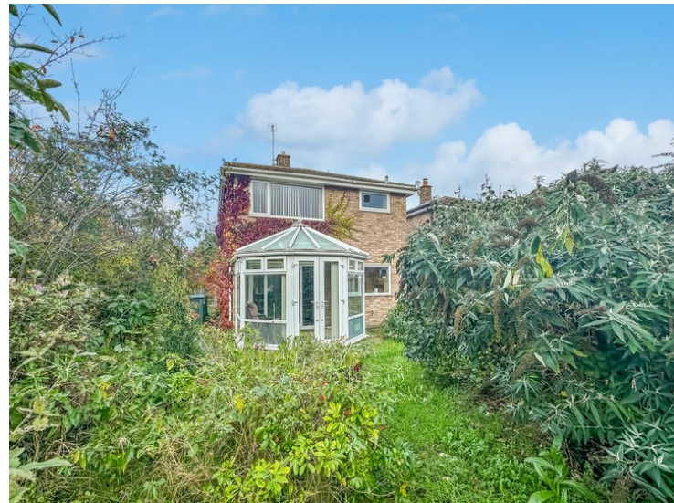
Externally the property offers an enclosed rear garden, surrounded by panel fencing and is mainly laid to lawn with gated access. Further to the rear offers a garage and single driveway with further on street parking. To the front of the property offers a large greenery, ideal for dog walkers or summer walks.