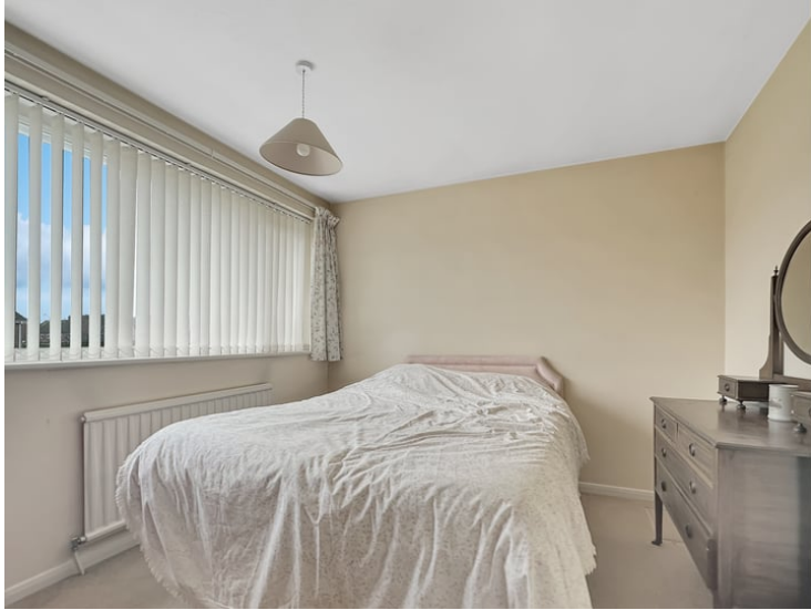
10' 11" x 9' ( 3.33m x 2.74m ) UPVC window to rear aspect, radiator.