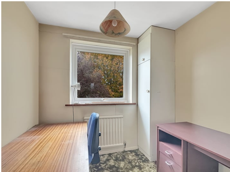
8' 8" x 5' 8" ( 2.64m x 1.73m ) UPVC window to rear aspect, radiator.