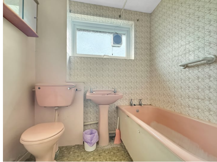
Low level W.C, panelled bath, window to rear aspect, radiator, vanity wash basin.