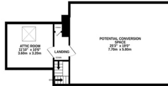
1ST FLOOR 650 sq.ft. (60.4 sq.m.) approx.