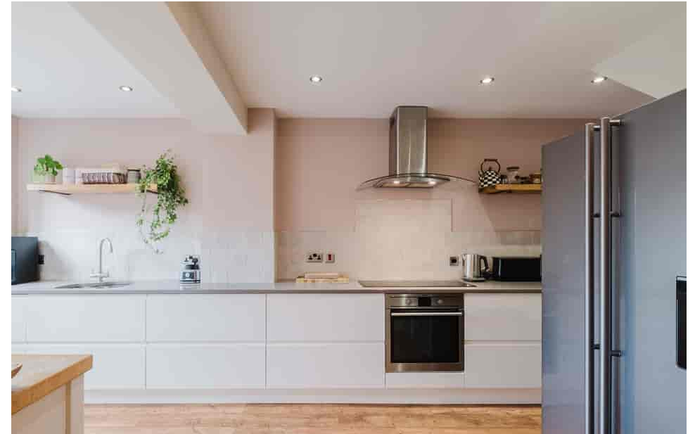
Berkeley Close, Northampton NN1 5BJ Guide Price £400,000 - Freehold