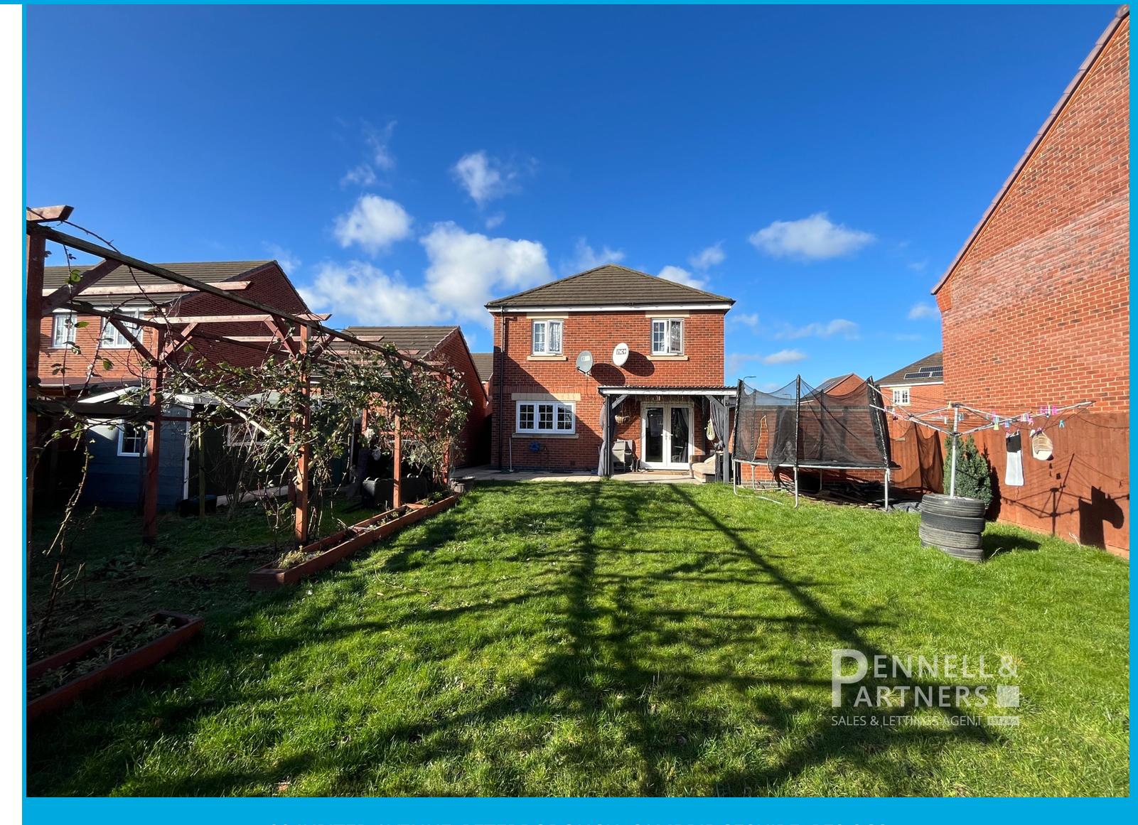
80 JUPITER AVENUE, PETERBOROUGH, CAMBRIDGESHIRE. PE2 8GS