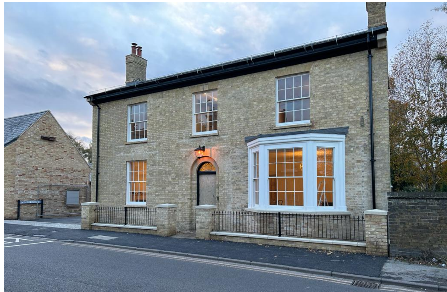
22 Fortrey House, London Road, Chatteris PE16 6AS