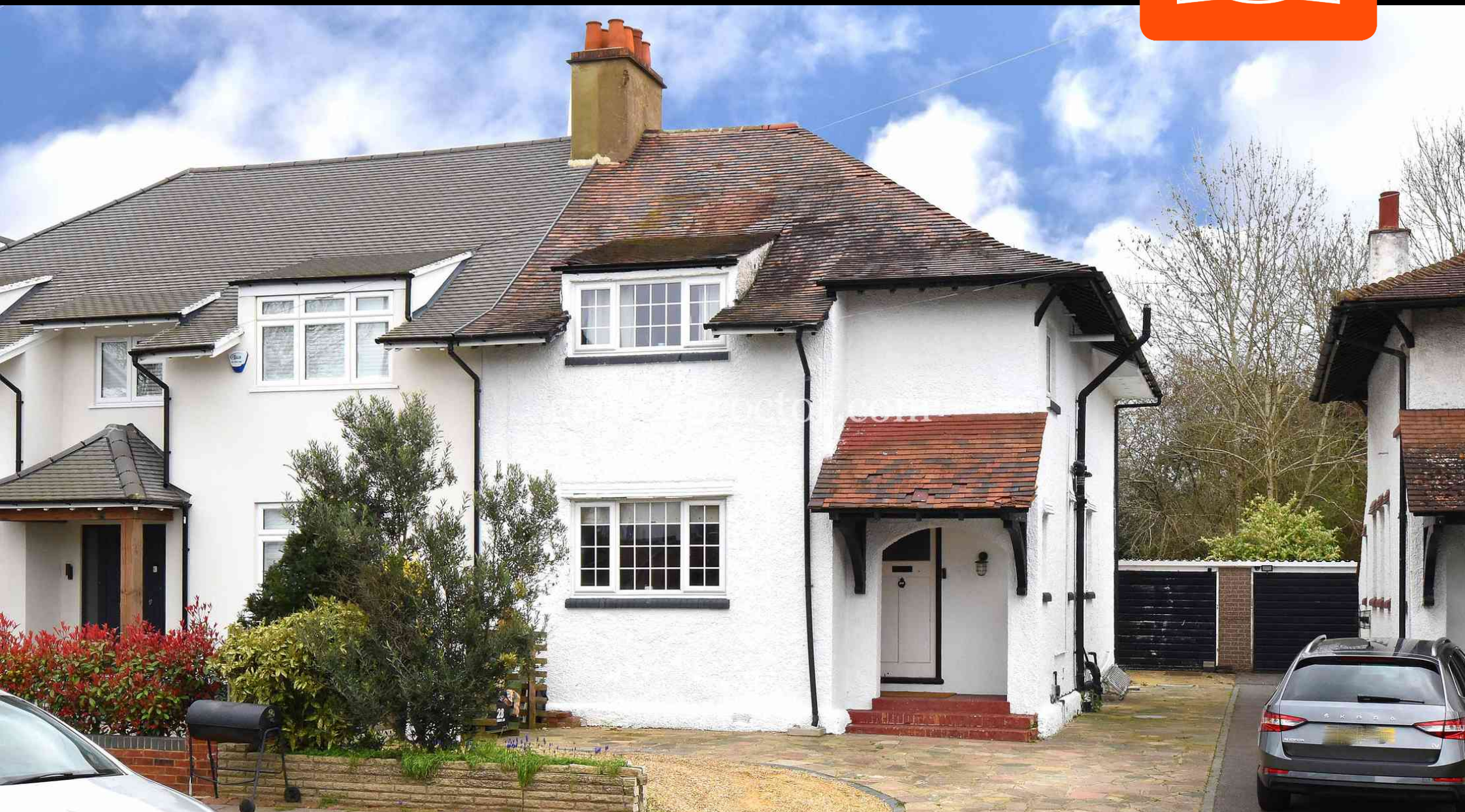
Blackbrook Lane, Bromley, Kent. BR2 8AY