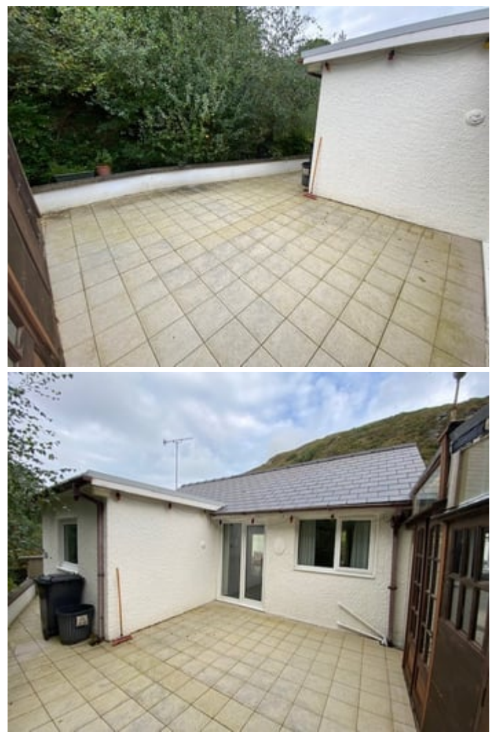
Garden Room/Sun Room

Gateway gives access to the rear enclosed private level paved patio area.