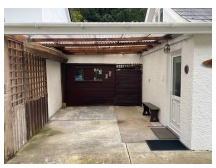
Covered Car Port